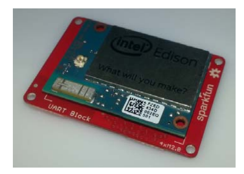
UART Block Installed

To use the UART Block, attach an Intel Edison to the back of the board or add it to your current stack. Blocks can be stacked without hardware, but it leaves the expansion connectors unprotected from mechanical stress.